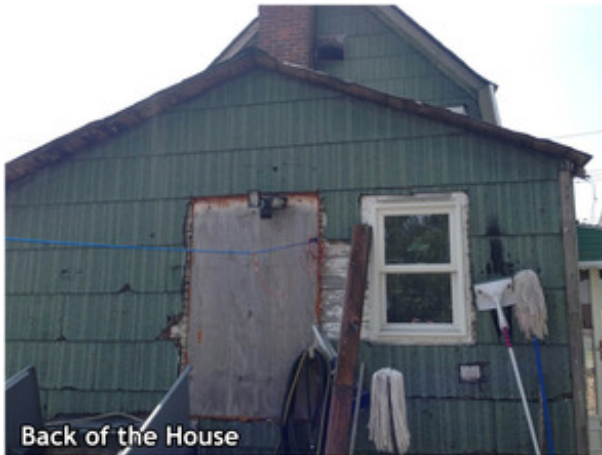
Back of the House